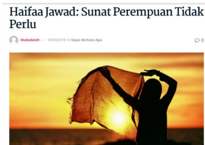
Figure 2. Example of Article on the Rejection of Practice of FGM Article Title 'Haifaa Jawaad: Female Genital Mutilation is Unnecessary'

In addition, KPPPA and UNFPA also socialized the Prevention of Gender-Based Violence and Harmful Practices using a gender transformative approach (involving men) and an ecological approach in North Lombok (2019–2021) through a program titled the Better Reproductive Health and Rights for All in Indonesia (BERANI) (UNFPA, 2023). The program involved 394 participants, consisting of 234 women and 159 men in Tenige and Tanjung villages, North Lombok. Ultimately, the program resulted in regulations applied in the two villages on preventing child marriage and protecting women's rights from gender-based violence in 2021. This was able to encourage behavior change in men and boys in the two assisted villages and to improve better understanding of the people on the issue of women's vulnerability to violence. They also managed to pass village regulations on the protection of the rights of both women and girls.