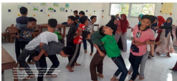
Figure 3. Socialization of Prevention Gender Based Violence and Harmful Practices in Lombok Utara

In addition, KPPPA and UNFPA also socialized the Prevention of Gender-Based Violence and Harmful Practices using a gender transformative approach (involving men) and an ecological approach in North Lombok (2019–2021) through a program titled the Better Reproductive Health and Rights for All in Indonesia (BERANI) (UNFPA, 2023). The program involved 394 participants, consisting of 234 women and 159 men in Tenige and Tanjung villages, North Lombok. Ultimately, the program resulted in regulations applied in the two villages on preventing child marriage and protecting women's rights from gender-based violence in 2021. This was able to encourage behavior change in men and boys in the two assisted villages and to improve better understanding of the people on the issue of women's vulnerability to violence. They also managed to pass village regulations on the protection of the rights of both women and girls.